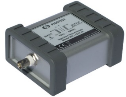
J2101A Injection Transformer (10Hz-45 MHz)