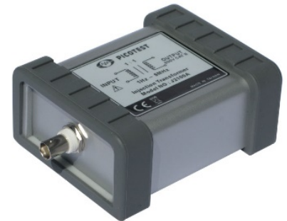
J2100A Injection Transformer (1Hz-5MHz)