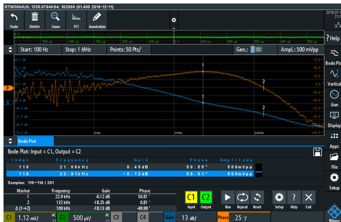
Bode plot measured using the Picotest J2100A and Rohde & Schwarz RTM oscilloscope

Set up diagram to measure Bode plots. The oscilloscope supplies the stimulus signal which is injected into the control loop via the Picotest J2100A, J2101A, or J2110A Signal Injector.