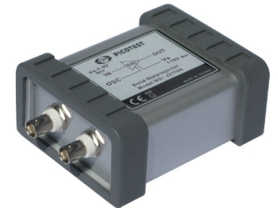
J2110A Solid State Injector (DC-40MHz+)

To learn how this solution can address your specific needs please contact Picotest: