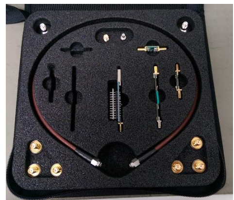
PCK01 High Performance Cable and Connector Kit

Picotest provides products that are designed to simplify measurements while providing the ultimate resolution and fidelity.