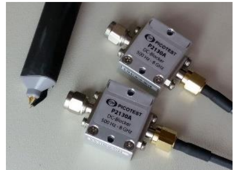
P21B01 PDN Probe Bundle and DC Blockers (2-Port Probe shown)