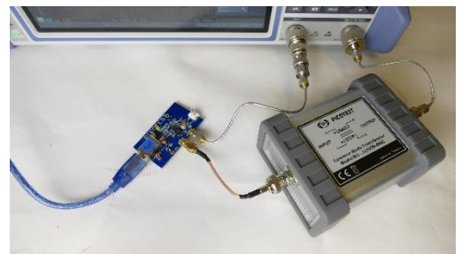
2-Port Shunt-Through test setup using the Rohde & Schwarz ZNL6 VNA and the J2102B-BNC